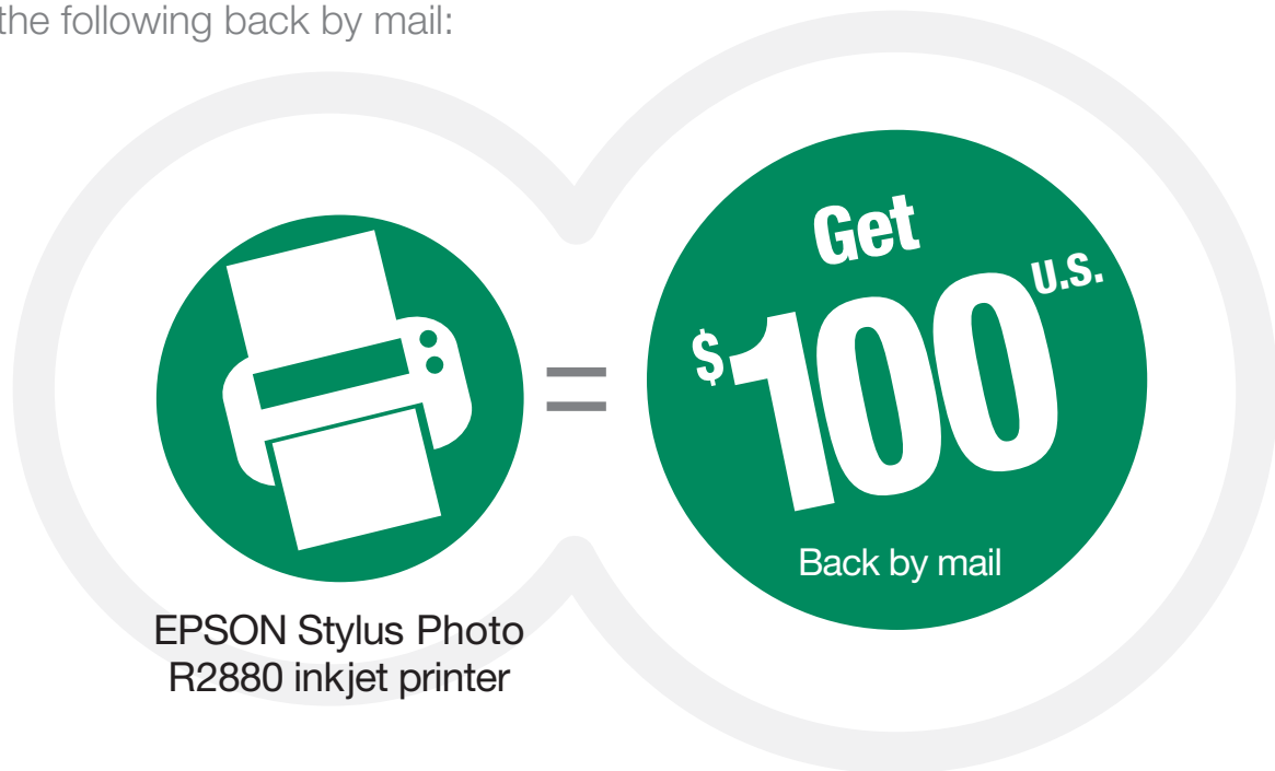
EPSON Stylus Photo R2880 inkjet printer

CLAIMS MUST BE POSTMARKED WITHIN 30 DAYS FROM THE PURCHASE DATE. PRODUCT MUST BE PURCHASED BETWEEN 5/1/12 AND 5/31/12.