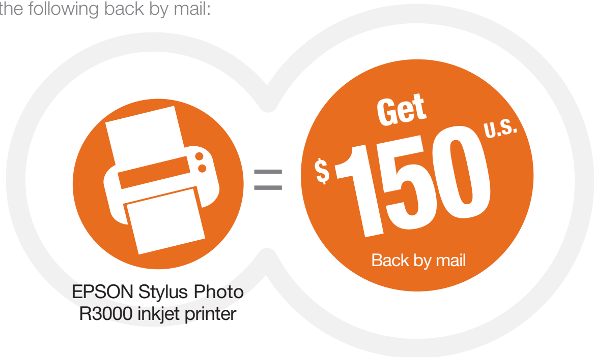
EPSON Stylus Photo R3000 inkjet printer

CLAIMS MUST BE POSTMARKED WITHIN 30 DAYS FROM THE PURCHASE DATE. PRODUCT MUST BE PURCHASED BETWEEN 5/1/12 AND 5/31/12.