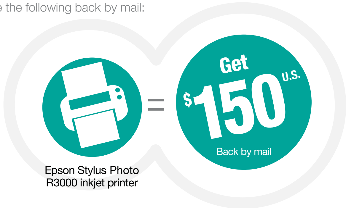
Epson Stylus Photo R3000 inkjet printer

CLAIMS MUST BE POSTMARKED WITHIN 30 DAYS FROM THE PURCHASE DATE. PRODUCT MUST BE PURCHASED BETWEEN 5/1/13 AND 6/30/13.