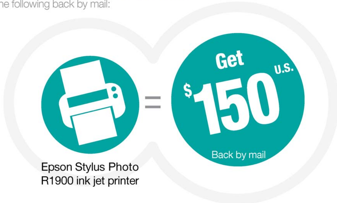
Epson Stylus Photo R1900 ink jet printer

Buy an Epson Stylus® Photo R1900 ink jet printer and receive the following back by mail: