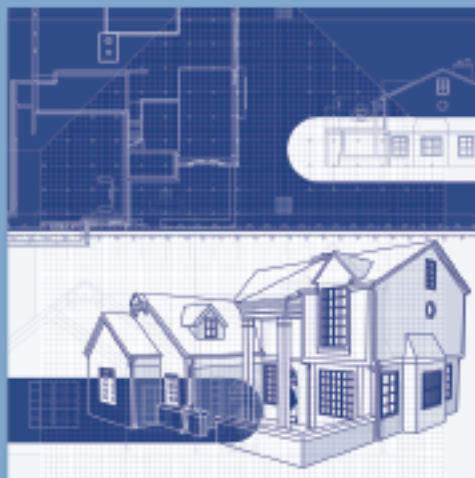
Photo-quality images print fast, too. Produce a full-color, high-resolution, A0-sized (10.76 ft. 2 ) image in under five minutes.