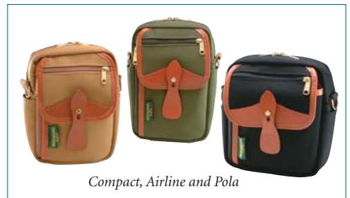
Compact, Airline and Pola