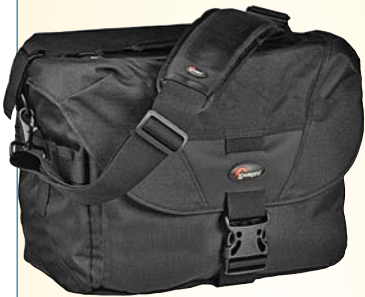
Stealth Reporter D650 AW

This three compartment backpack carries a digital pro SLR with lens attached, 2-4 additional lenses (up to 80-200 mm), a 17" notebook computer, digital accessories and personal gear. But capacity alone is not what makes the CompuRover AW so amazing. It's packed with features that every digital Adventure photographer will appreciate: a drop-down tripod holder, cable management bag, removable waist belt, built-in memory card pouch and the patented All Weather Cover..... 189.95