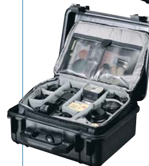
Omni Sport & Sport Extreme