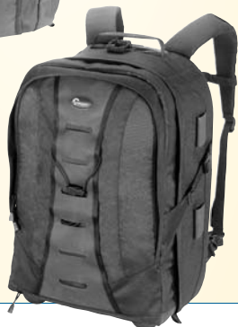
Rolling CompuTrekker Plus AW

The CompuTrekker AW is for photojournalist and location photographers who want to take a camera system with a laptop on a day trip, or who need a safe and compact way to safely store and transport their system. It holds an SLR with an 80-200 f/2.8 lens attached as well as an additional body and four or five more lenses, plus a laptop up to 15" long. Attachment loops expand your carrying capability with optional SlipLock accessories. Flexible interior dividers can be easily arranged to fit medium format or video equipment. The CompuTrekker AW offers reinforced construction, shock-absorbing closed-cell foam padding, tough water-resistant outer fabric, a built-in All Weather Cover, and a quick-access hide-away Tripod Mount. Main compartment: 11 x 5 x 15"; Laptop compartment: 12 x 1.5 x 15" (WDH)..... 149.95