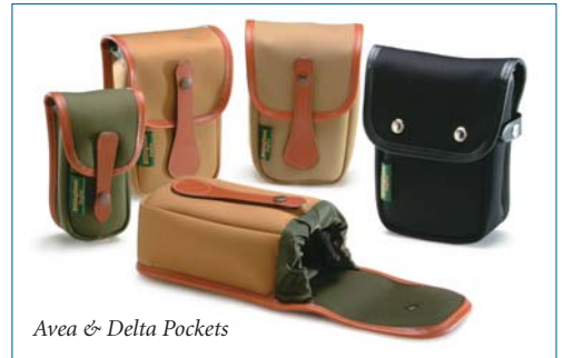
Avea & Delta Pockets

The Pola Stowaway is the same as the Compact and Airline Stowaways, except it is 7 x 3.25 x 8.25" and weighs 10.6 oz. They are available in Black with Black trim (BIPBB), and Black (BIPBT), Khaki (BIPK) and Sage (BIPS) colors with Tan leather trim..... 129.95