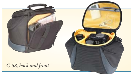
C-58, back and front