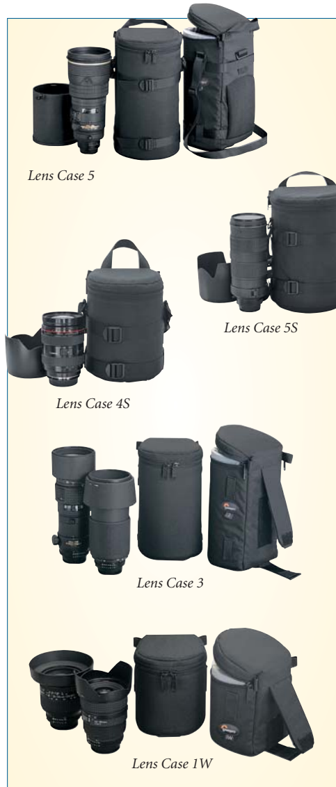
Lens Case 5

With a rigid base and additional padding for shorter, wider zoom lenses. Includes shoulder strap and compression straps to fasten to LowePro packs. Capacity: shorter, wider zooms such as 28–200mm f/3.5 with hood reversed; a 28–70mm f/2.8, 75–300mm f/4.0, or 35–350mm with their hood reversed; or a 17–35mm with hood. Interior size: 4.25 x 6" (DH) ..... 34.95