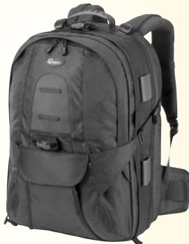
CompuTrekker Plus AW

The Lowepro Stealth Reporter D650 AW Shoulder Bag was created for photojournalists and news photographers. It is designed to withstand the elements while providing quick access to lenses and digital accessories. The bag is made from TXP ripstop and 2000D ballistic nylon with high density closed cell foam padding. There is a padded insert with adjustable dividers protects equipment from shock and scratching, plus a removable accessory pouch and memory card wallet. Ext. Dimensions 17.1 x 11 x 12.6" ..... 159.95