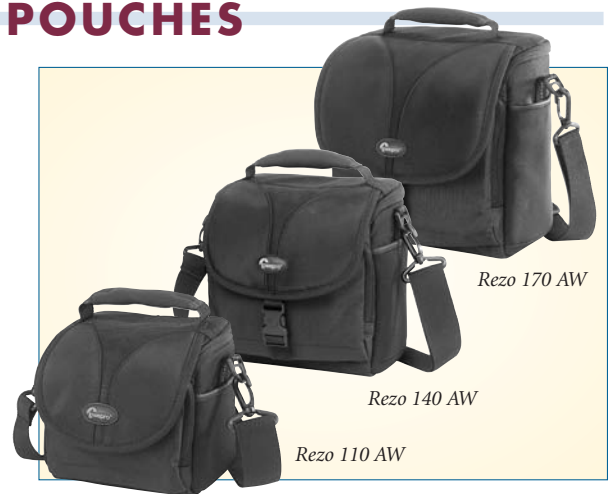
Rezo 170 AW

Rezo 110 AW (LOR110B): Inner dimensions are 6 x 3.9 x 5.1" (WDH) ..... 24.95