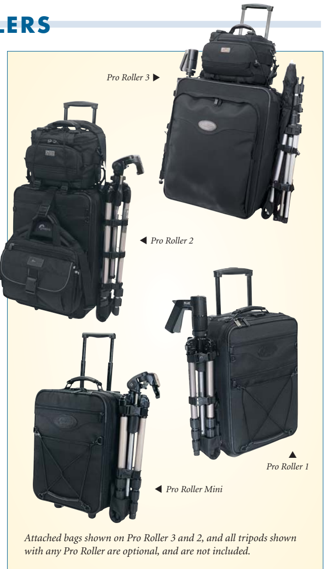
Attached bags shown on Pro Roller 3 and 2, and all tripods shown with any Pro Roller are optional, and are not included.

An ultra-compact professional rolling case, the Pro Roller Mini has a fully customizable interior removable insert for easy format changes and leather-wrapped padded top handle. It holds a pro SLR with an attached 80-200mm f/2.8 lens, an extra body, 4 more lenses and accessories. Interior size is 11 x 4.25 x 15.5" (WDH) ..... 199.95