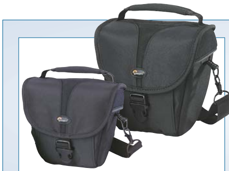
Rezo 110 AW