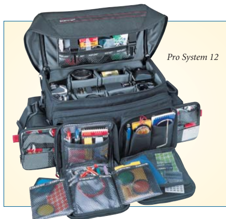
Pro System 12

Pro Systems bags are designed to carry two SLRs with lenses attached, numerous other lenses and accessories. They're loaded with features like Tamrac's patented Lens-Bridge divider system, adjustable foam-padded dividers, Tamrac's Memory & Battery Management System, ZipDrop paraphernalia and mesh pockets, end pockets and the unique Piggy-Back Pocket for slipping the bag over the handle of rolling luggage.