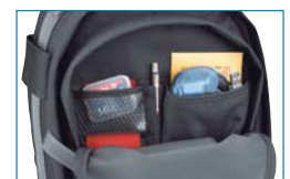
Front accessory pocket features Tamrac's Memory and Battery Management System

Expedition 3: Offers expedition-level performance in a compact photo backpack. This full-featured pack holds most SLRs with a lens attached up to 7" long, 2-3 lenses and accessories. Available in Black (TA5273B) and Green (TA5273GR). 9 x 6¼ x 13". It weighs 2 lb. .... 49.95