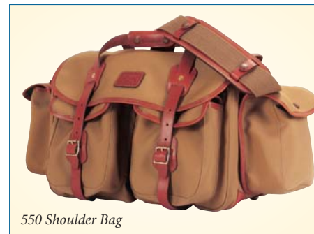
550 Shoulder Bag

A versatile soft camera bag with enough room for demanding assignments. It features two full height zippered pockets, two gusseted pockets, a zippered external back pocket, two detachable end pockets and an adjustable shoulder sling. The top flap completely protects the main compartment. The 550 includes 8-15, 9-15 and 9-18 Superflex removable partons. It's external dimensions are 18 x 11 x 11.5"; it's internal dimensions are 17.5 x 5.75 x 10" without the end pockets attached. It is available in Black with Black trim (BI550BB), and Black (BI550B), Khaki (BI550K) and Sage (BI4550SA) colors with Tan leather trim It weighs 5.73 lbs..... 474.95