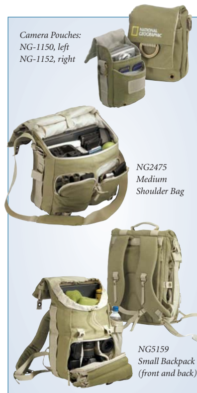
Camera Pouches: NG-1150, left NG-1152, right

Medium Shoulder Bag (NG2475) Holds all of your personal gear along with a laptop and medium-sized D/SLR. It features a designated removable insert that protects your camera, and separates your photographic gear from your personal items. It has two large front pockets, two small external pouches, a rear concealed pocket for document storage and an internal padded compartment for your laptop. 12.9 x 7 x 11", weighs 2.8 lbs.....100.00