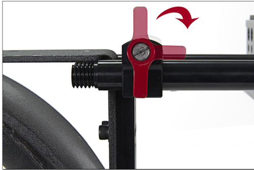
ADJUSTABLE KNOBS FOR ROD POSITION VIS D'AJUSTEMENT DE POSITION POUR RODS