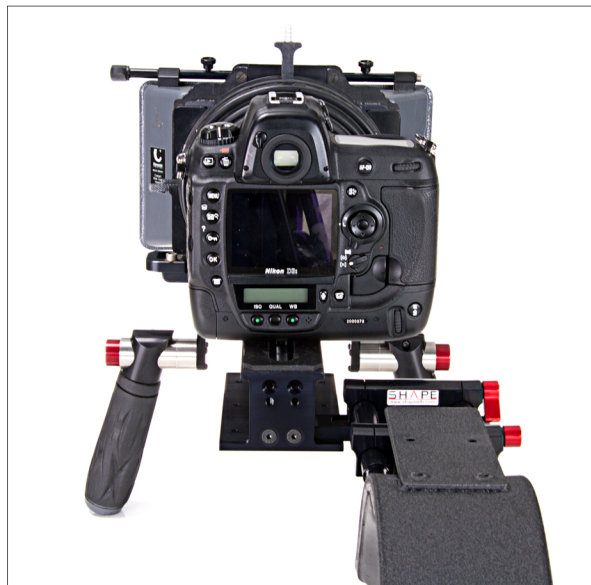
REAR VIEW IN OFFSET POSITION VUE ARRIÈRE EN POSITION DÉSAITÉE