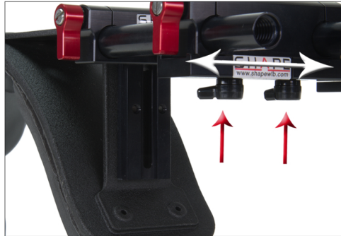
ADJUSTABLE KNOBS FOR SIDWAY POSITIONS VIS D'AJUSTEMENT DE POSITIONS LATÉRALES