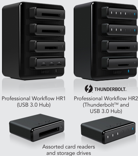
Professional Workflow HR1 (USB 3.0 Hub)