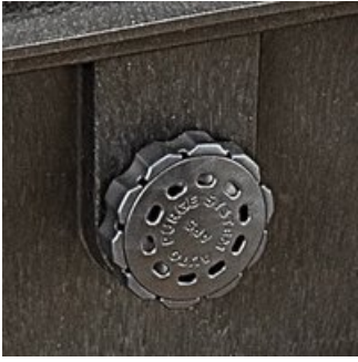
Automatic pressure release valve.