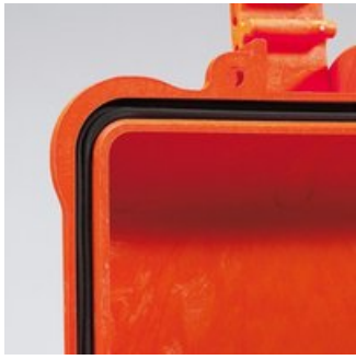
(Art. NEOSEAL + nr. art.)