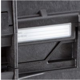
PVC waterproof ID removable label