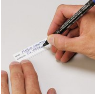
(Art. LABELCOVER + nr. art.)