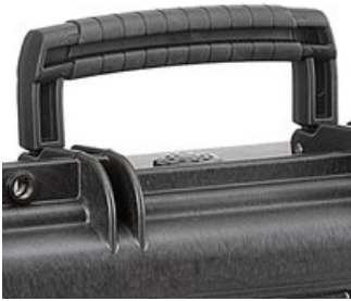
Load tested handle, reinforced with corrosion proof steel pins