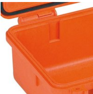
Internal slots for optional panel mounting brackets or panel mounting rings