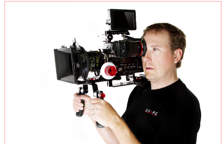
SUGGESTED SETUP WITH ALPHATRON EVF / CONFIGURATION SUGGÉRÉE AVEC VISEUR EXTERNE ALPHATRON