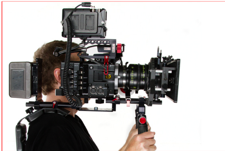
COMBINED WITH TOP HANDLE FOR EVF& MONITOR ADDONS / COMBINAISON DE LA TOP HANDLE POUR AJOUT DE VISEUR & MONITEUR