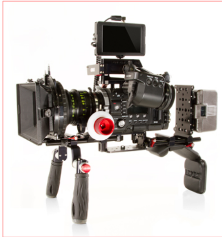
SUGGESTED SETUP WITH SONY F5-F55 / CONFIGURATION SUGGÉRÉE AVEC SONY F5-F55