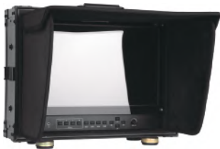
A: Engineering aluminum Case + Sun-Hood