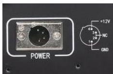
XLR Power Interface