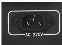
AC 220V Power Interface