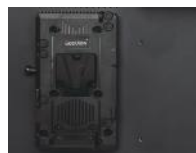
V-mount battery plate