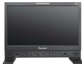
B: T type base