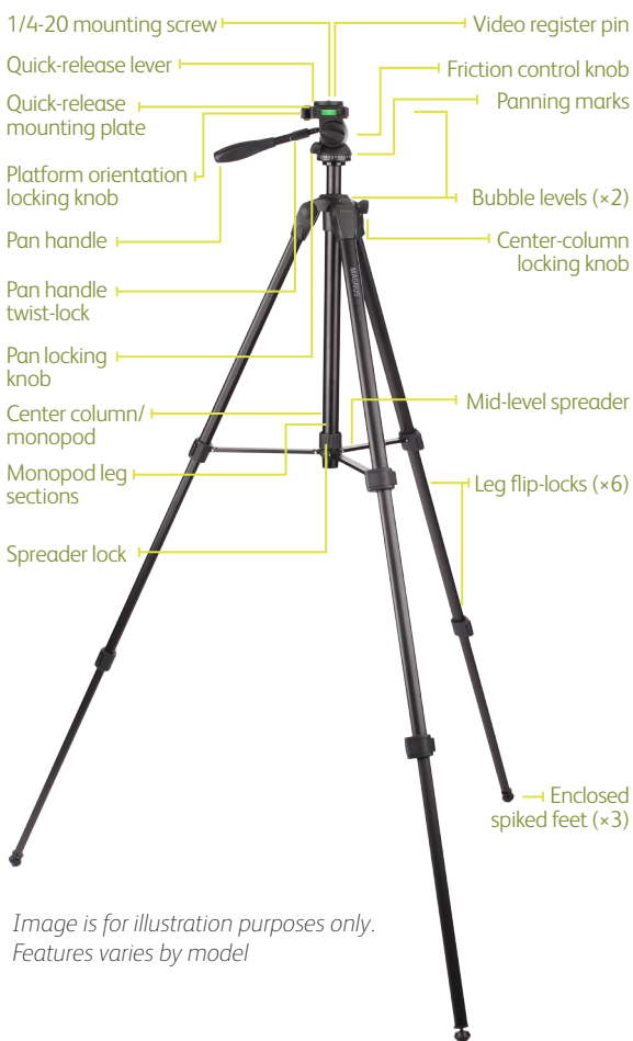
Image is for illustration purposes only. Features varies by model