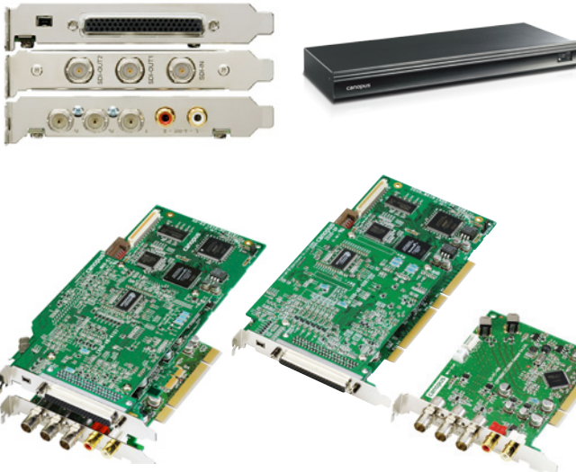
PCI-e Version (showing main board and HD component output board in a stacked orientation)