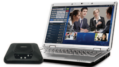
PCs via Bluetooth or USB