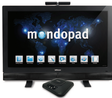
Mondopad via Bluetooth or USB

Use Thunder with the InFocus Mondopad for clear, efficient videoconferences in small-to-medium sized rooms, or in larger rooms with the optional Mic Pods. You can also use it with any other PC-based communication software (such as Skype, Lync, Jabber, etc.) to enhance audio quality and comfort. Its Bluetooth connectivity makes it easy to use with mobile devices.