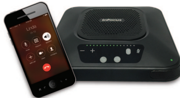
Mobile phone via Bluetooth