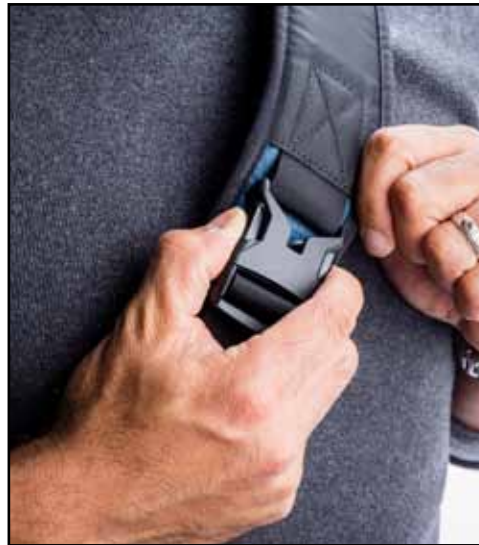
Shoulder strap quick release buckle