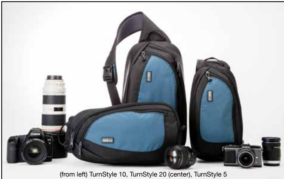
(from left) TurnStyle 10, TurnStyle 20 (center), TurnStyle 5

thinkTANK photo Be Ready "Before The Moment™"