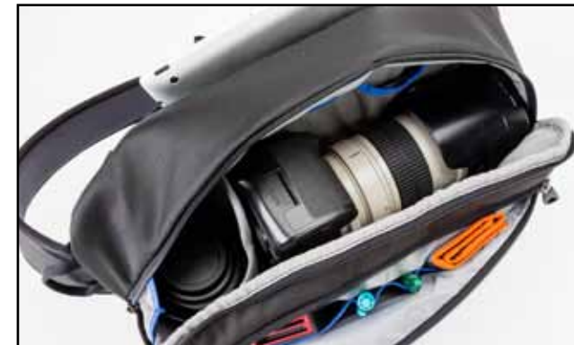
TurnStyle 20: Fits a standard size DSLR