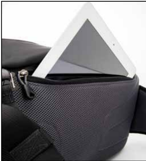
Padded tablet pocket for iPad or iPad mini