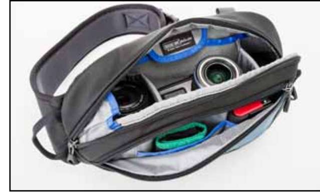
TurnStyle 5: Fits mirrorless camera systems