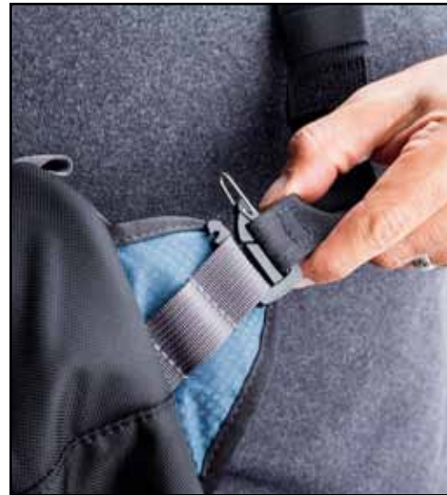
Mounting points for a waistbelt or sling conversion