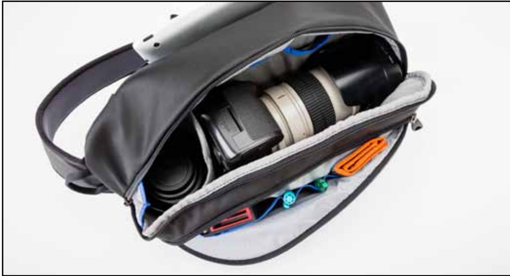
Front organizer pocket for pens, memory wallets and small accessories