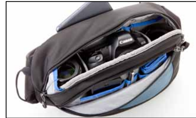
TurnStyle 10: Fits a standard size DSLR