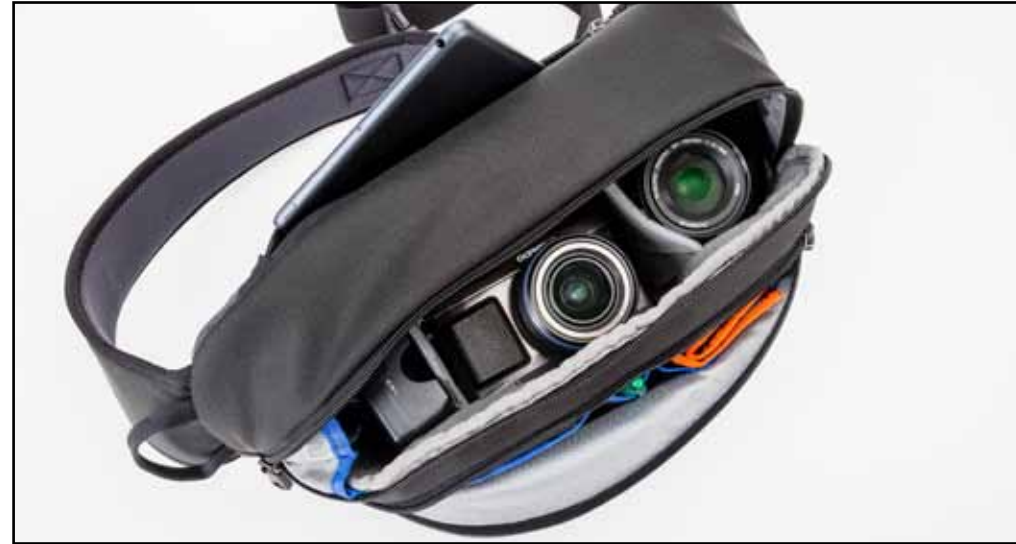
Main camera compartment