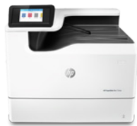
HP PageWide Pro 750dw