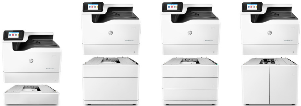
550-sheet paper tray (A7W99A)