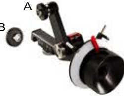
FOLLOW FOCUS PRO A - GO43-0.8PRO B - G028-0.8PRO