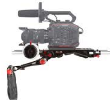
FINAL RESULT / RÉSULTAT FINAL

SHAPE RESERVES THE RIGHT TO USE ANY PHOTOS INCLUDING SHAPE PRODUCTS FOR MARKETING PURPOSES