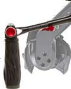
TELESCOPIC HANDLE ARRI ROSETTE / POIGNÉE ULTIME À ROSETTE