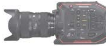
CAMERA (NOT INCLUDED / NON INCLUSE)

SOLID ANODISED ALUMINUM LIGHTWEIGHT DESIGN DESIGN LÉGER D'ALUMINIUM ANODISÉ