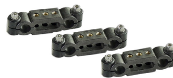
Accessory Mounting Adapter