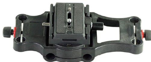
Camera Base with Quick Release