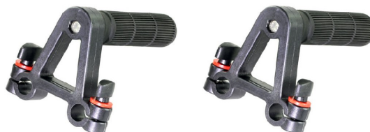
2 x Side Handles