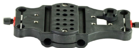
Cage Top Plate