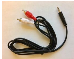
RCA to 3.5mm cord

An AUX IN/auxiliary jack (3.5mm) input is provided for connecting external devices such as LCD TV, CD / DVD player, iPod.