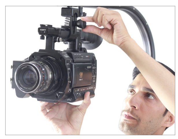
NOTE: Through the Balance Adjustment Knob, you can adjust the tension anticlockwise according to the weight of your setup.