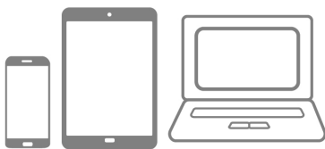
USB Type C connector