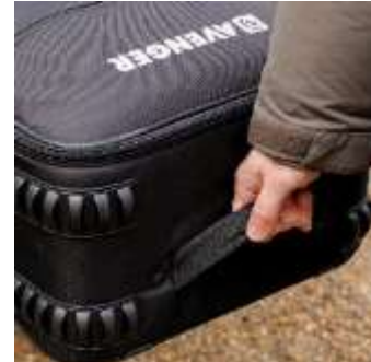
Strong exterior padded handles for ease of maneuverability