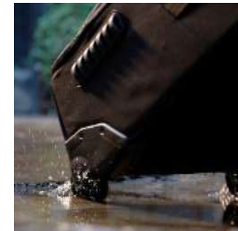
Water-resistant 900D Polyester