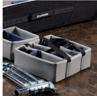
Removable padded storage trays