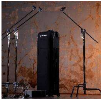
Tailored for carrying up to three turtle base (detachable) C stand kits and accessories