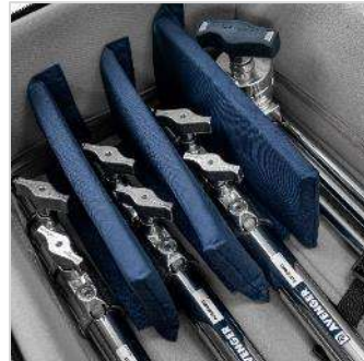
High-density closed cell and cross link foam dividers