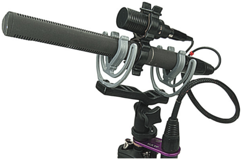
Example for use

The Emesser (ATE 208) is very small “figure-of-eight” microphone intended to convert any boom mike on the fly into a M/S stereo system.