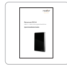
Quick Installation Guide