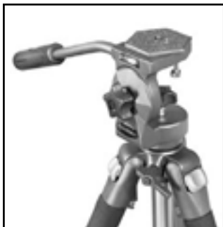
BARSKA Model AF10738 Professional Photo Tripod

When observing with a large aperture binocular like the Encounter, a sturdy photo tripod such as the BARSKA AF10738 or an altazimuth mount is required. To attach the Encounter to a photo tripod, simply thread the tripod's 1/4"-20 mounting stud into the threaded hole in the Encounter's mounting plate.