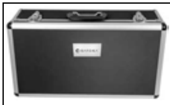
Hard Storage Case

Congratulations on your purchase of a BARSKA Encounter 16x70mm Binocular Telescope. Please carefully read the following instructions. With proper care and use of this instrument, you will be assured of many years of enjoyable viewing.