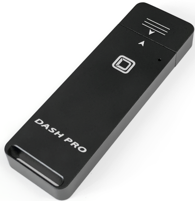
Dash Pro Flash Drive

For more information, visit our website at www.oyendigital.com