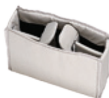
Photo Insert for Messenger Bags