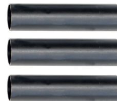
6" scaffold Legs