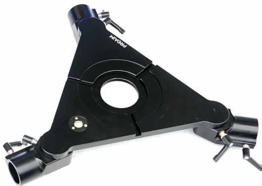
Mitchell Mount Plate

Please inspect the contents of your shipped package to ensure you have received everything that is listed below.