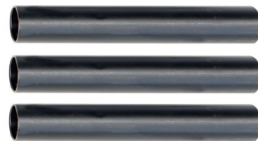
12" scaffold Legs