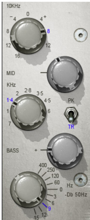
At left: The EQ section of the Kramer HLS.